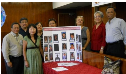
DVR and SRC Members during NDEAM Resource Fair

DISID's Aging and Disability Resource Center (ADRC) Program is funded through a grant from the Administration on Community Living (ACL) that is administered by the Guam Behavioral Health & Wellness Center (GBHWC) and staff is assigned to DISID. ADRC has established a web-based information system (GuamGetCare.org) that has a Client Care Record component, which provides consumers the ability to manage and coordinate their own care with family and caregivers. The Guam GetCare database has had over 662,137 hits and includes more than 3,747 Client records and over 250 Service Provider resource listings and program information for clients seeking services. The online Resource Directory is regularly updated by ADRC staff and training is regularly provided regarding the utilization of the system.