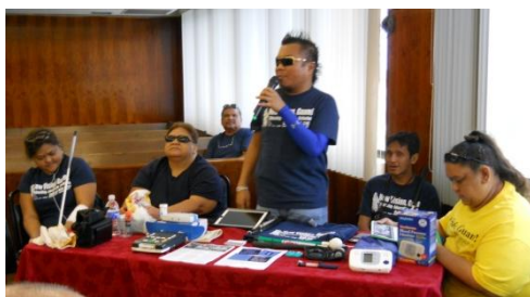
New Vision Members during NDEAM Resource Fair