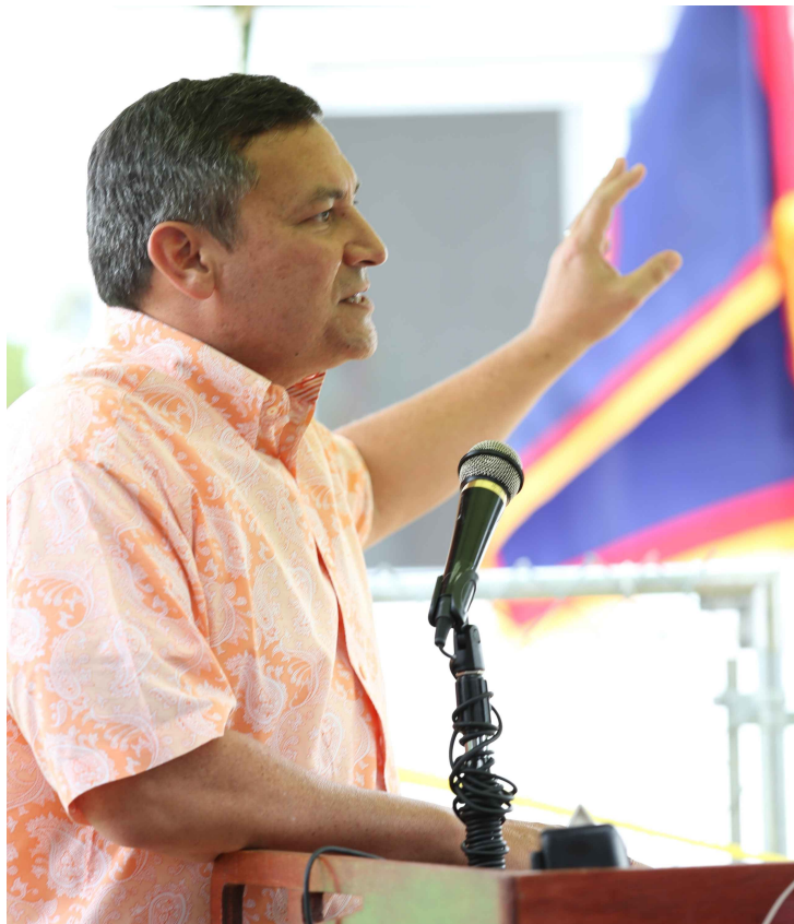
Governor Calvo speaks at Sagan Linahyan, a neighborhood he personally visited last year and vowed to help. He is speaking about the rehabilitation of the community in this photo.