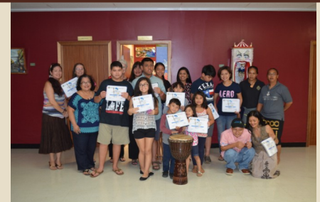
Certificate Presentation Everyone is an Artist at ❤️ Workshop! Art Workshops for children with autism