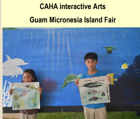
CAHA interactive Arts Guam Micronesia Island Fair