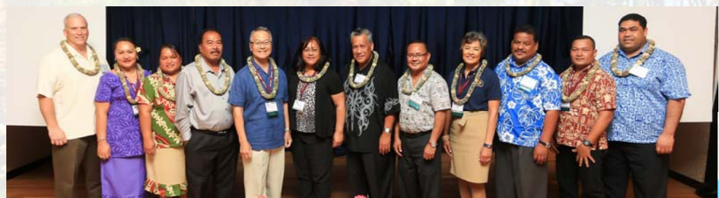
APIPA Principals and distinguished guests at the 2015 APIPA Conference.

We were pleased to host the 26 th Annual Association of Pacific Islands Public Auditors (APIPA) Conference in August 2015. Auditors and finance officers throughout Guam and Micronesia received valuable continuing professional education to help improve accountability and transparency and achieve good governance. The conference offered a wide range of ideas and courses, such as Audit, Government Finance, Grants Management, Leadership, and other courses to help professionals support and provide extended services to their organizations.