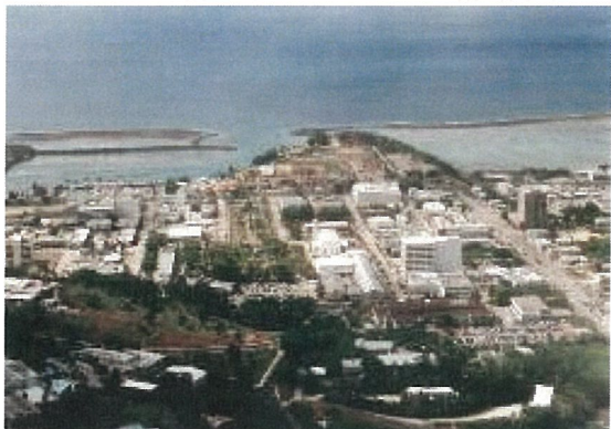
Arial View of Hagatna